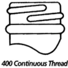
400 Continuous Thread