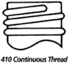
410 Continuous Thread