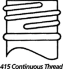
415 Continuous Thread